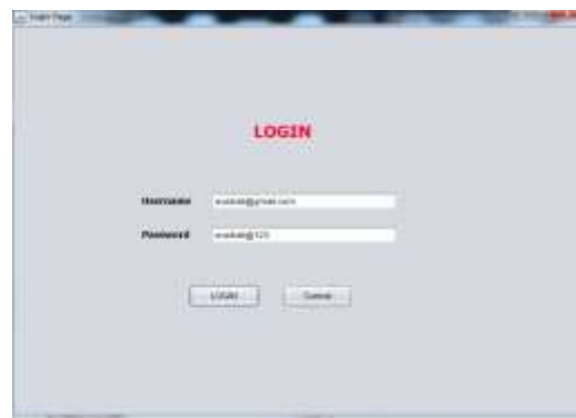
Fig 1.2 Login

Once the registration is done the user can login to the system. This module will ask the user to provide the username and password. This will be accepted in speech. Speech conversion will be done to text and user will be told to validate whether the details are entered correctly or not. Once the entry is done correctly database will be checked for entry. If the user is authorized it will be directed to homepage.