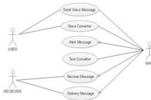
Fig: ER Diagram